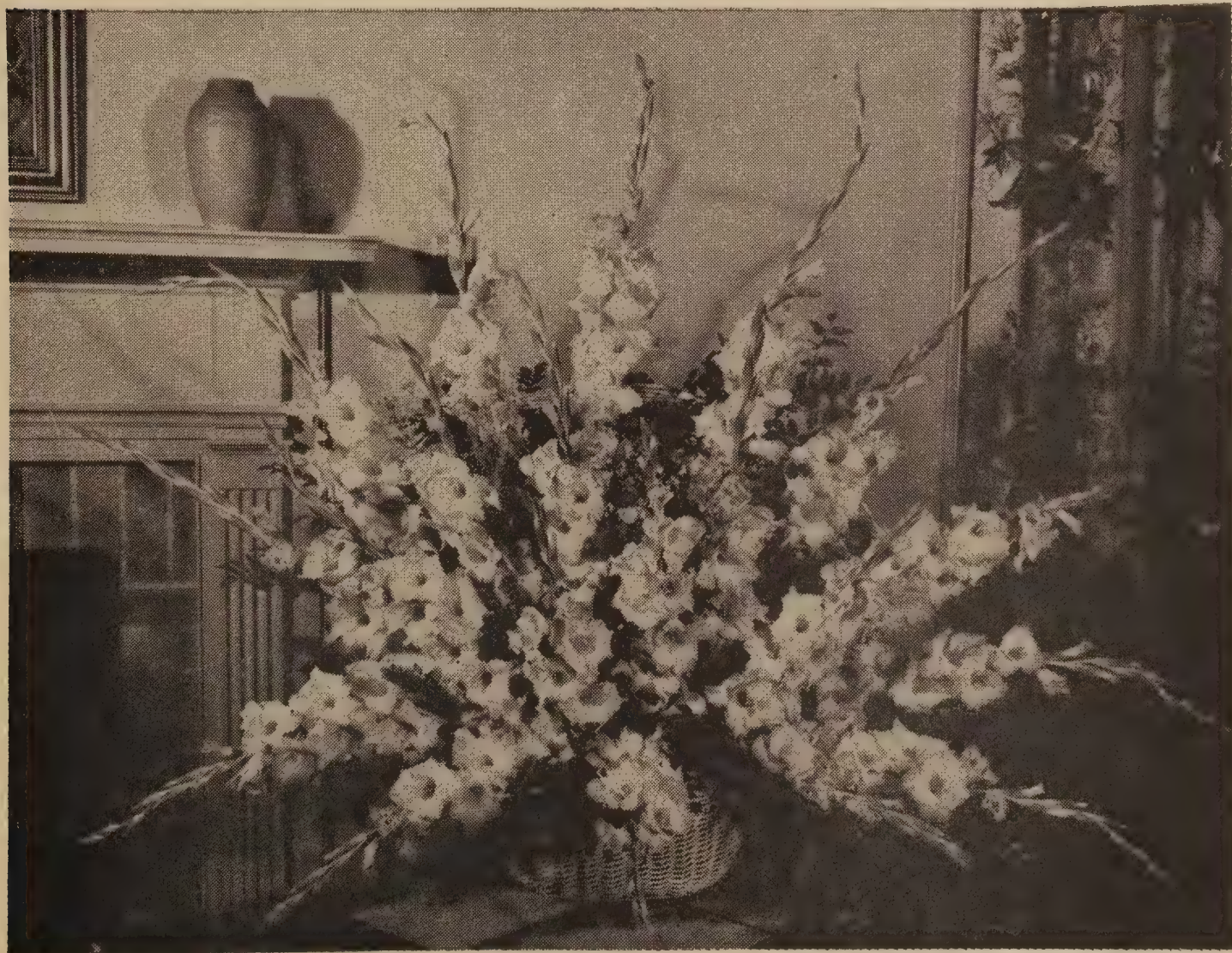
BASKET OF FRIENDSHIP

Lg. 75c; Med. 50c; Sm. 35c; Bts. 6 for 25c, 50 for $1.00; Unit $3.50.